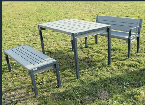
PICNIC TABLE AND BENCHES