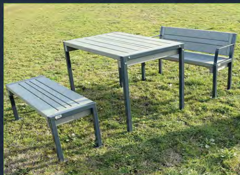
PICNIC TABLE AND BENCHES